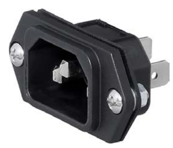
6100-3 with sealing kit IP54 to appliance (without locking brackets)