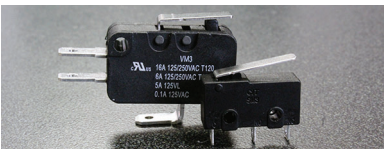
Snap Action Switches

With sealing degree of IP67, CIT Relay & Switch Vandal-Resistant Switches are available in a variety of sizes from 12mm FH & GH Series up to the 40mm DH Series. Also available with UL approval in our AHU and DH22U Series, our IP67 switches offer both ring and dot illumination and non-illuminated options. Choose the EH Series anti-vandal switch for a rounded convex actuator or the AH, BH, CH or DH Series for a flat actuator. Choices of body and actuator color include stainless steel, nickel and anodized aluminum in black, red, yellow, green or blue, with LED bi-color options.