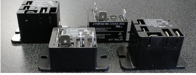
J115F 40amp Series

Relays and switches are becoming highly used in the emerging market of EV Charging Stations. CIT Relay & Switch has a wide variety of relays and switches to suit these products and can customize as needed.