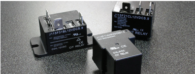
J115F 50amp Series

The J115F Series of relays are available in three styles, all offering heavy contact load up to 40 amp and strong shock and vibration resistance in light-weight and small size packages. PC pin mounting or panel mounting option is dependent upon the style chosen, with contact arrangements ranging from 1A to 1C. Coil voltage ranges from 5VDC to 277VAC with coil power of .60W or .90W or AC coil power of .2VA. Dimensions are depending upon series, with mounting tabs also available. UL and TÜV certified.