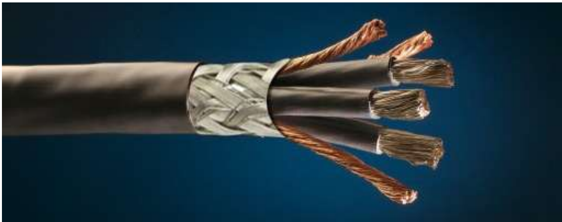
Figure 1. VFD cable

Cable used to connect the VFD drive to the motor affect how well the VFD system handles the phenomena with potential to disrupt operations. Cables designed specifically for VFD applications (see Figure 1) withstand these phenomena. And, equally important, they do nothing to make the situation worse. A generic motor supply cable is not designed with the specific requirements of VFD system in mind actually cause problems.