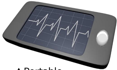
▲ Portable Electrocardiograph