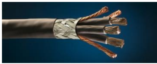
Figure 1. VFD Cable

Shielding serves the double purpose of keeping noise generated by the VFD cable from escaping, and preventing noise generated outside the system from being picked up. There are three types of shields typically used: