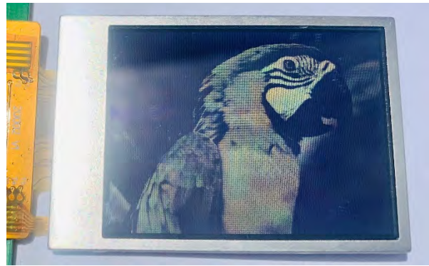
Focus LCDs Transflective TFT: Reflective mode (with backlight)

The transflective TFT reflects the bright ambient lighting to illuminate the display. Power is conserved when opting not to use the backlight LEDs which make transflective displays energy efficient and ideal for outdoor applications. It is important to note that displays in very bright environments will appear to have reduced color. In dark environments the image will appear to be more vibrant and colorful. The perceived color variation is due to the contrast in the lighting environment. A transmissive TFT would typically have limited visibility in direct sunlight while the transflective TFT can be visible in any environment. The ambient lighting levels can compensate for the lower power consumption of the backlight without sacrificing image visibility.