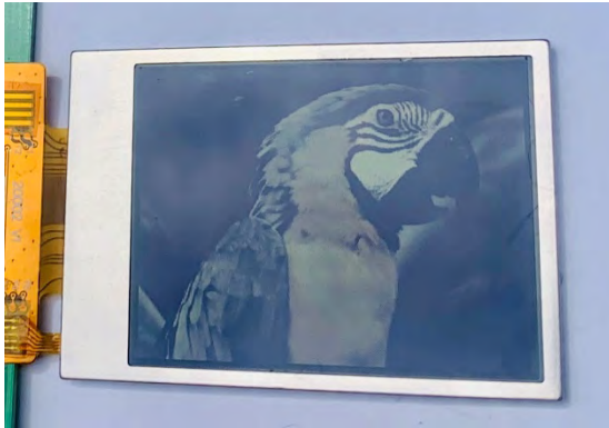
Focus LCDs Transflective TFT: Reflective mode (no backlight)