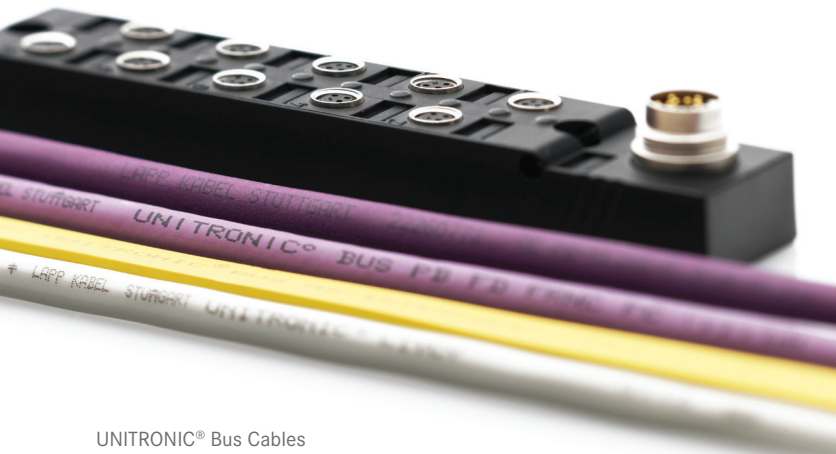
UNITRONIC® Bus Cables

These include new open protocols such as OPC UA and MQTT as well as the new physical layer coming soon, single-pair Ethernet. Choosing a cable specifically designed for either industrial Ethernet or the modern fieldbus systems, depending on your plant setup, is an important step in optimizing your industrial process control system.