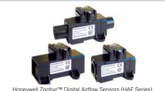
Honeywell Zephyr™ Digital Airflow Sensors (HAF Series) 10 SLPM to 300 SLPM